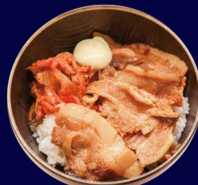
豚キムチ飯 Buta Kimchi Meshi Kimchi and marinated pork on rice 7.00 €