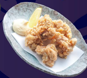
鶏の唐揚げ Karaage Deep fried chicken (4pic) 5.00 € (8pic) 10.00 €