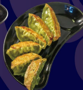
野菜餃子 Yasai Gyoza Fried spinach dumplings with a vegetable filling (6pic) 5.50 € (12pic) 10.00 €