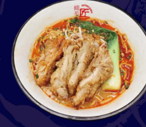
鶏南蛮のせ担々麺 Namban Tan Tan Tan Tan Men with deep fried chicken 17.50 €