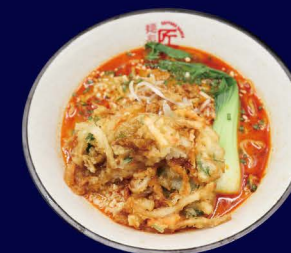
かき揚げベジ担々麺 Gemüse Tempura Tan Tan Veggie Tan Tan Men with vegetable tempura 17.50 €