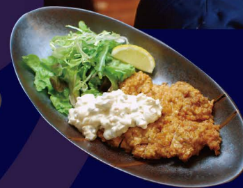
鶏南蛮 Nanban Deep fried chicken - Nanban style (Half) 6.00 € (Full) 10.00 €