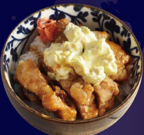
鶏南蛮飯 Namban Meshi Deep fried chicken on rice 7.00 €