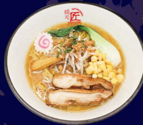
鶏がら味噌ラーメン Tori Miso Ramen Ramen with teriyaki chicken (miso flavor) 13.50 €