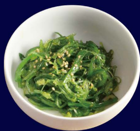
茎わかめ Kuki Wakame Seaweed salad 4.50 €