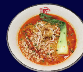
熱烈担々麺 Tan Tan Men 13.50 € Spicy ramen with minced chicken meat (sesame miso flavor)