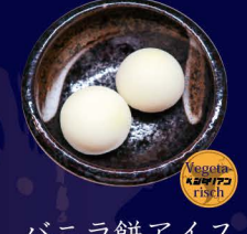
バニラ餅アイス Mochi vanilla ice Vanilla ice cream wrapped in Japanese rice cake 3.50 €