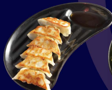
焼き餃子 Gyoza Fried dumplings with a minced chicken meat filling (6pic) 5.50 € (12pic) 10.00 €