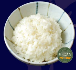
ご飯 Rice 2.50 €