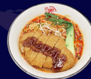
ヴィーガンカツ担々麺 Vegan Katsu Tan Tan Spicy ramen with deep fried vegan escalope 17.50 €