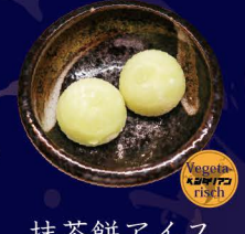
抹茶餅アイス Mochi matcha ice Green tea flavored ice cream wrapped in Japanese rice cake 3.50 €