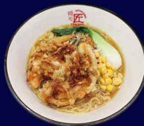
かき揚げベジ味噌ラーメン Gemüse Tempura Miso Ramen Miso ramen with vegetable tempura 17.50 €