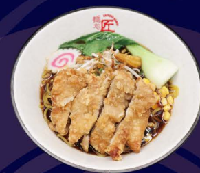
南蛮醤油ラーメン Namban Shoyu Ramen Shoyu ramen with deep fried chicken 16.00 €