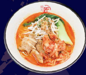
豚キムチ味噌ラーメン Butakimchi Miso Ramen Ramen with kimchi and marinated Pork (miso flavor) 17.00 €