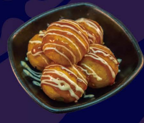
たこ焼き Takoyaki Small dough balls with pieces of octopus 6.00 €