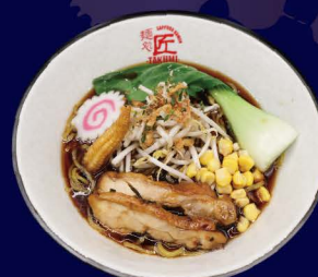
鶏がら醤油ラーメン Tori Shoyu Ramen Ramen with teriyaki chicken (soy sauce flavor) 12.00 €