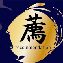
濃厚鶏塩ラーメン (数量限定) Noukou Tori Shio Ramen (Limited Edition) 15.00 € Shio ramen with a special triple concentrated, creamy broth with an soft egg and minced chicken meat