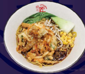
かき揚げベジ醤油ラーメン Gemüse Tempura Shoyu Ramen Shoyu ramen with vegetable tempura 16.00 €