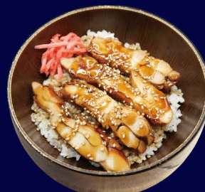
照り焼き飯 Teriyaki Meshi Teriyaki chicken on rice 7.00 €