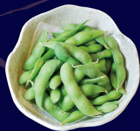
枝豆 Edamame Cooked soybeans 4.50 €