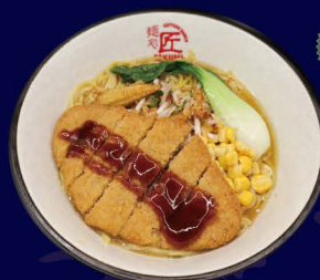
ヴィーガンカツ味噌ラーメン Vegan Katsu Miso Ramen Miso ramen with deep fried vegan escalope 17.50 €