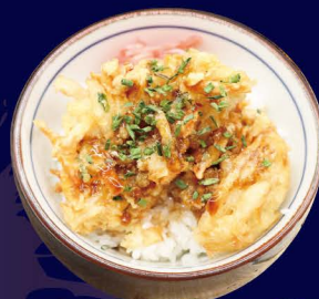
かき揚げ飯 Kakiage Meshi Vegetable tempura on rice 7.00 €