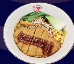
ヴィーガンカツ醤油ラーメン Vegan Katsu Shoyu Ramen Shoyu ramen with deep fried vegan escalope 16.00 €